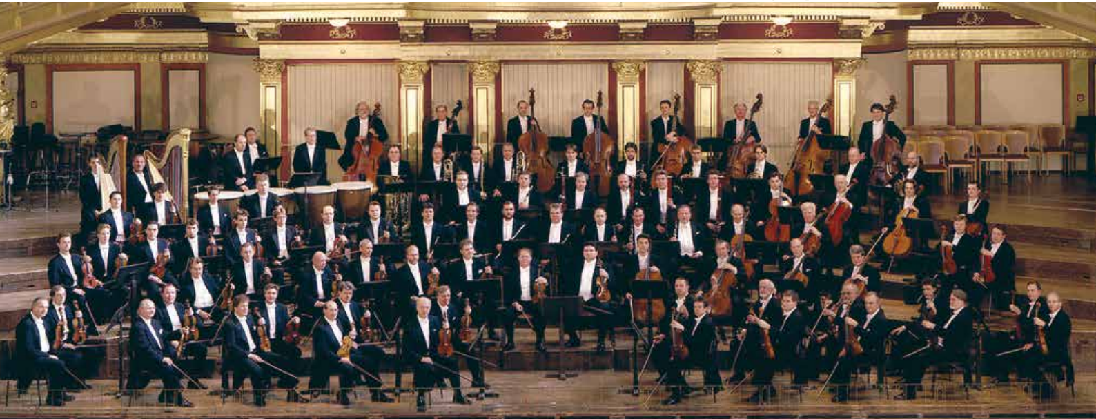
Vienna Philharmonic Orchestra