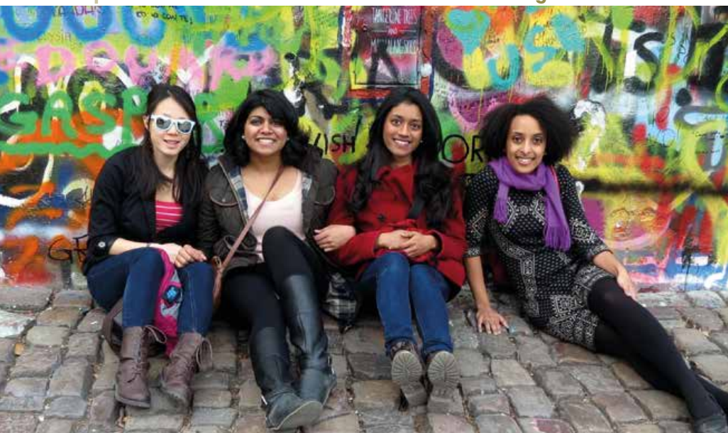
Max Kade Medical Students from the US in Vienna