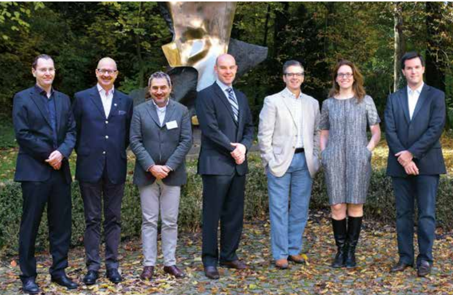
Faculty of the 20 th Salzburg Cleveland Clinic Seminar 2015