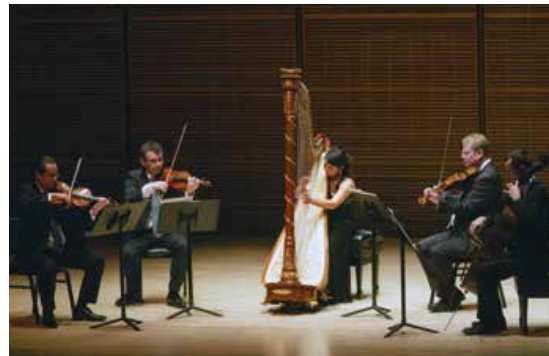
Music for Medicine 2015

The concert was followed by dinner and a live auction, raising a total of $ 600,000.