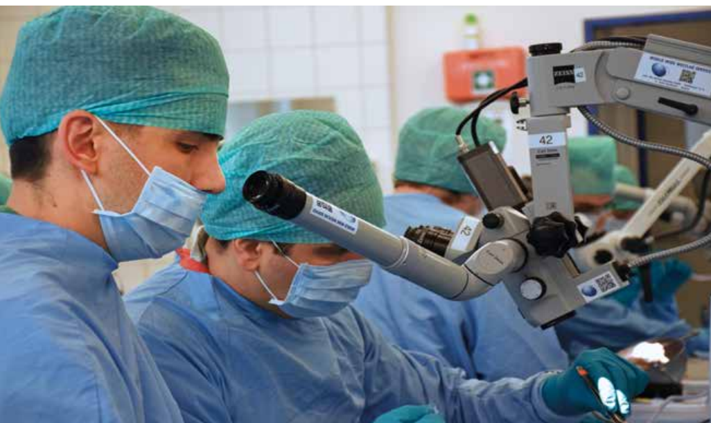
Temporal Bone Surgery Seminar