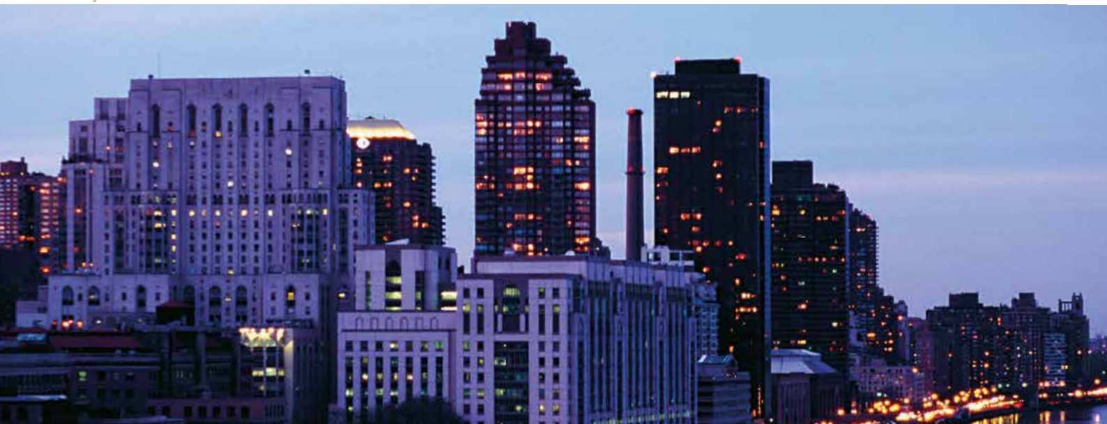
NewYork-Presbyterian Hospital and The Hospital for Special Surgery