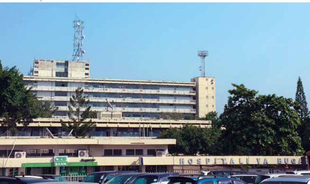
Weill Bugando Hospital, Mwanza, Tanzania