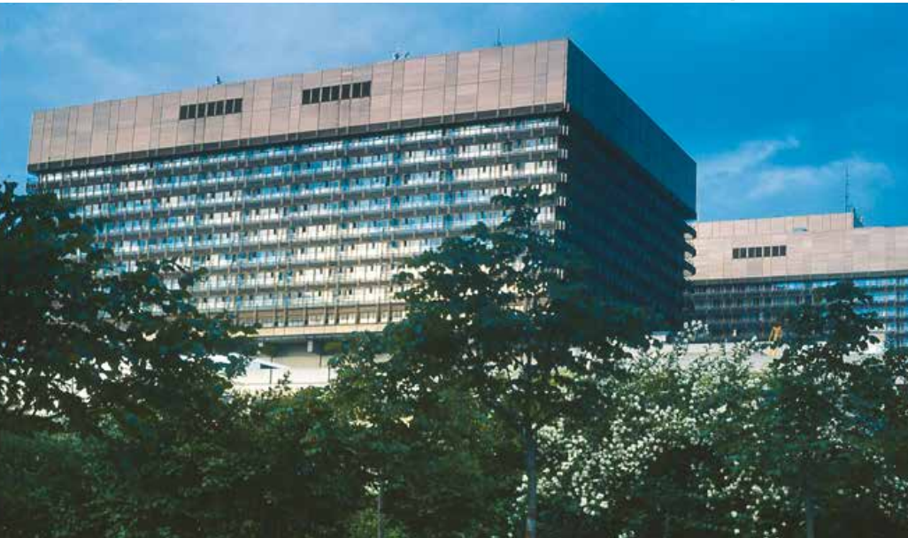
The University Hospital of Vienna (Allgemeines Krankenhaus), Vienna, Austria