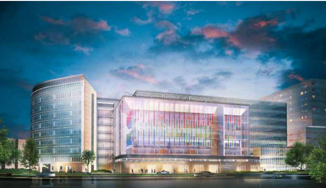
The Children's Hospital of Philadelphia