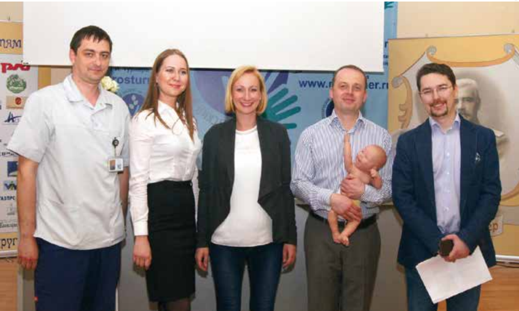
Pediatric Orthopedics Satellite Symposium in St. Petersburg, Russia