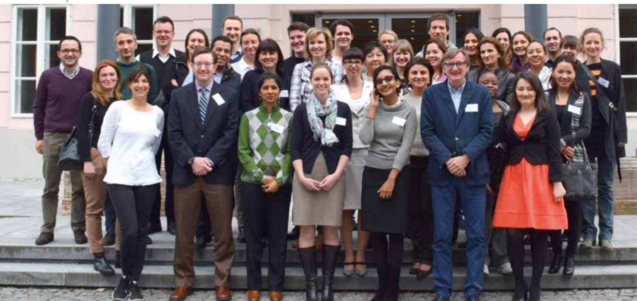
95 th Salzburg CHOP Seminar 2015: Pediatric Cardiology Seminar participants